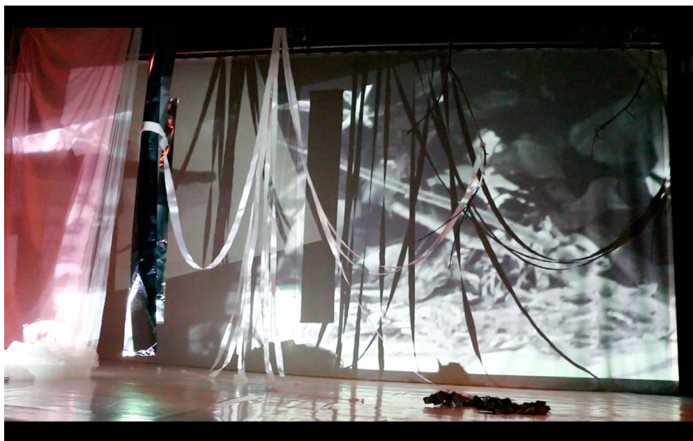
Figure 4. Augmented reality/digital forest. 'Constructing Realities' workshop. CNDP Bucharest, 2018 © DAP-Lab.