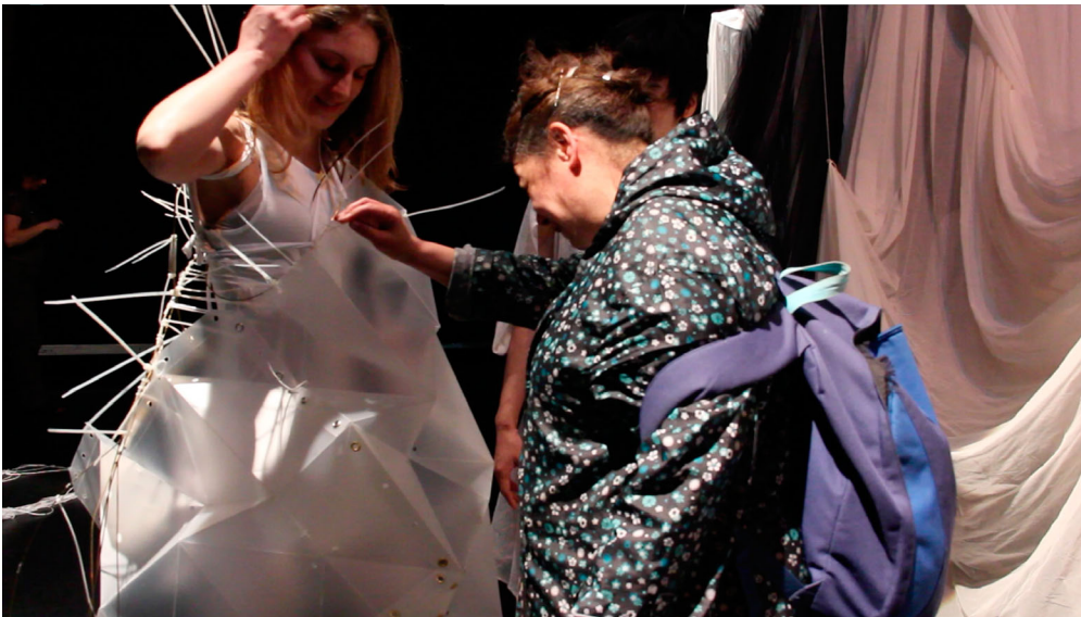
Figure 7. Vision-impaired audience member touches dancer's costume in metakimosphere no.3 , OrigamiDress design by Michèle Danjoux, 2016