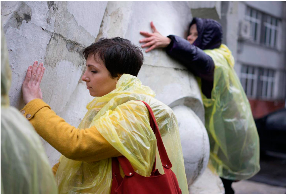
Figure 6. Tactile Dialogues (Vadim Sidur), curated by Fayen d'Evie and Shelley Lasica with Irina Povolutskaya, 2016.