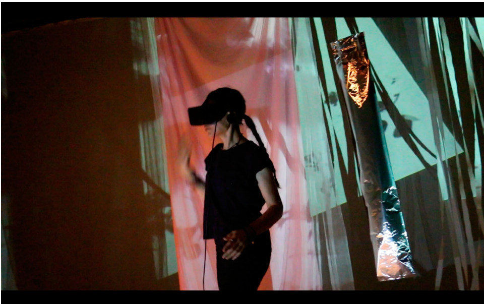
Figure 1. Visitor wandering through augmented virtuality environment, with her right hand feeling imaginary resistance. CNDP Bucharest, 2018