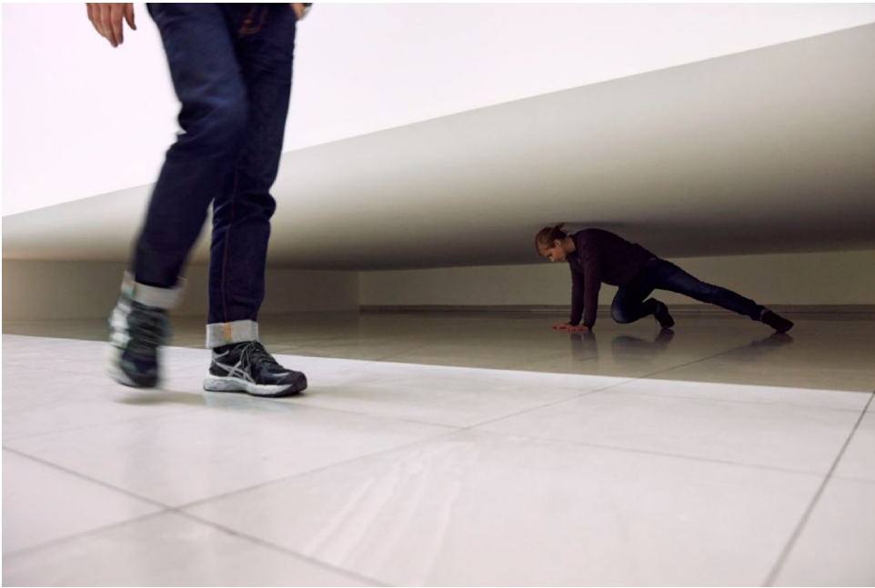
Figure 2. William Forsythe, A Volume, within which it is not Possible for Certain Classes of Action to Arise , 2015, MMK Museum für Moderne Kunst Frankfurt.