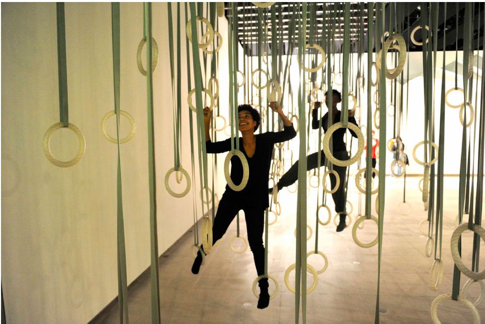
Figure 3. Visitors playing in William Forsythe's choreographic object The Fact of Matter , installation at Move: Choreographing You , Hayward Gallery, Southbank Centre, London, 2010–2011.