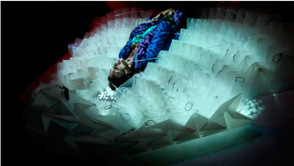
Figure 9. Visitor having dived into coral reef and watery projection, kimosphere no.4 © DAP-Lab.

a scenographic strategy engaging audiences to step inside and come closer, touch, listen and act in greater intimacy with unfolding actions. They are breathing spaces, currents felt through sonorous, tactile connections. Surfaces and the blurring of the physical-virtual boundary require a creative investment from the audience, particularly in the case of the VR masks that need to be worn.