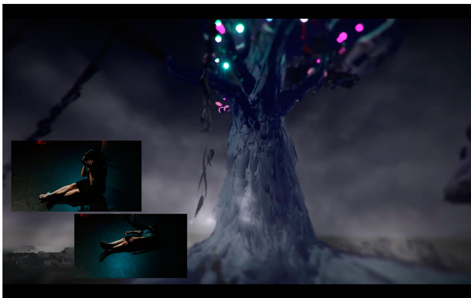
Figure 10. Visitor enacting/embodying what she perceives inside ‘Lemurs’ forest interface with VIVE goggles, conducted by Doros Polydorou, kimosphere no. 4 . 2017

meditative resonances derived from the floating ‘coral reef’ or the ‘Red Ghost’ poetry game, and collective encounters with others in the red forest; then there are the VR interfaces where visitors enter ghostly worlds via goggles. kimosphere no. 4 thus combines real/virtual atmospheres both actuated through the same tactile narrative, neither quite plausible and yet transforming ways of knowing the body and how it acts in gravity-bound space. We cannot predict how visitors project the evolutionary tale of the lemurs migrating from Africa to Madagascar. Yet the critical aspect for us is the immersants’ sensory participation, letting resonances of real and virtual spaces become rhythmically entwined.