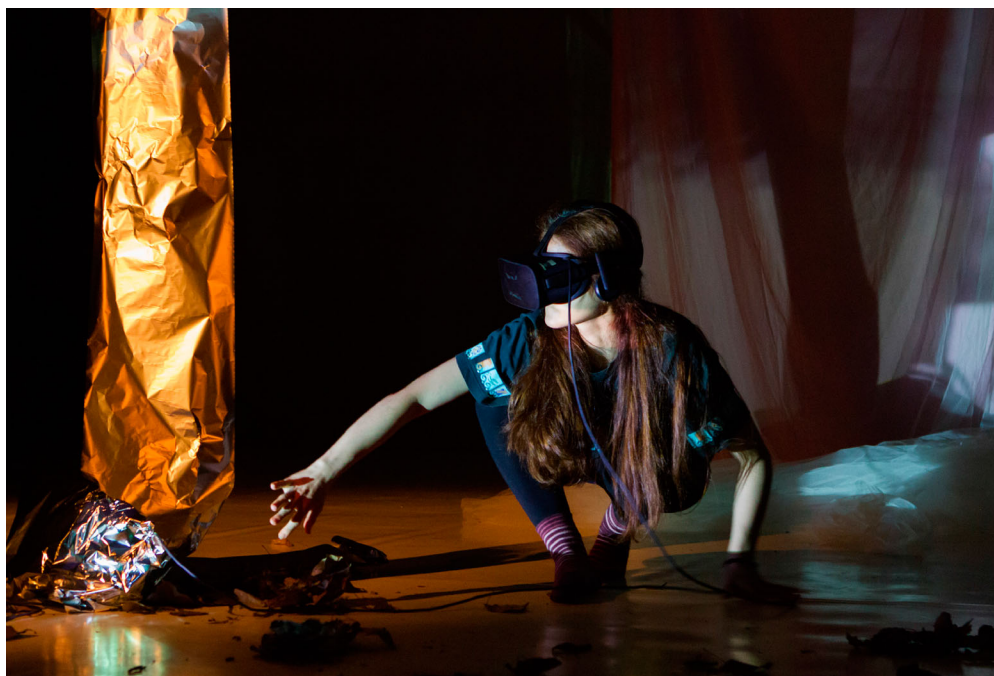
Figure 5. Visitor touching branch in virtual forest, inside augmented virtuality space where the sound of the suspended silver foil creates a rustling (of leaves). CNDP Bucharest, 2018 © DAP-Lab.